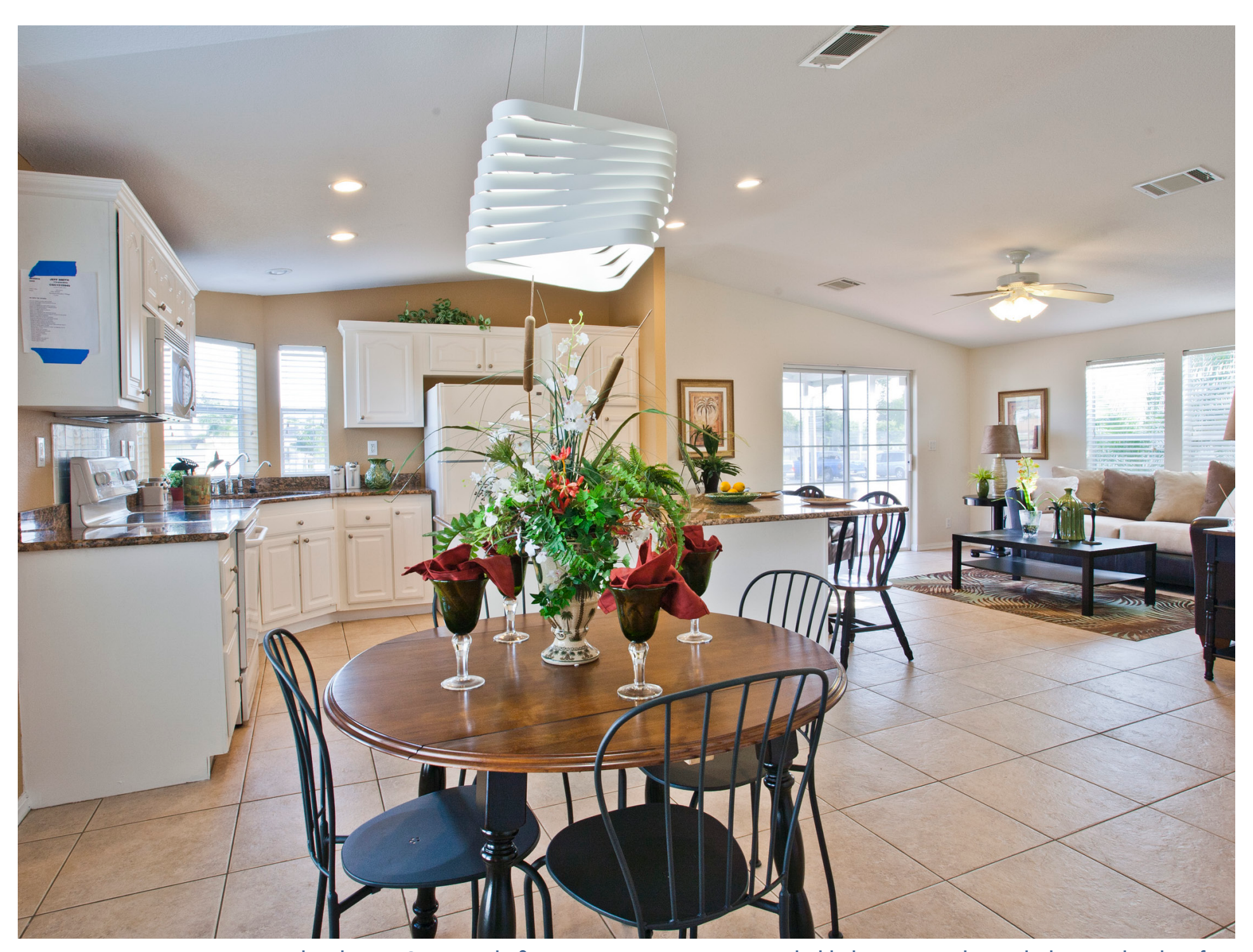
Upgrades shown: Ceramic tile floor, granite counters, upgraded lighting, paned French door and ceiling fan.