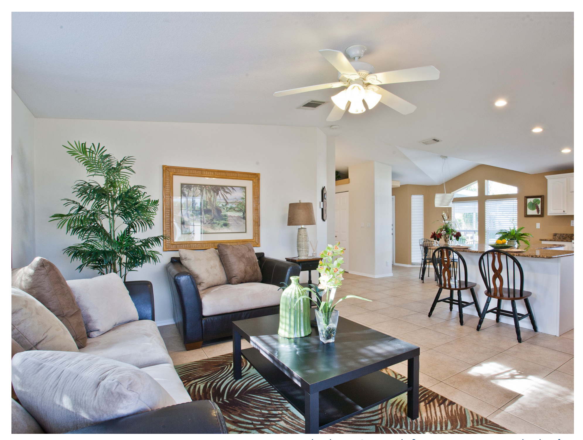
Upgrades shown: Ceramic tile floor, granite counters and ceiling fan.