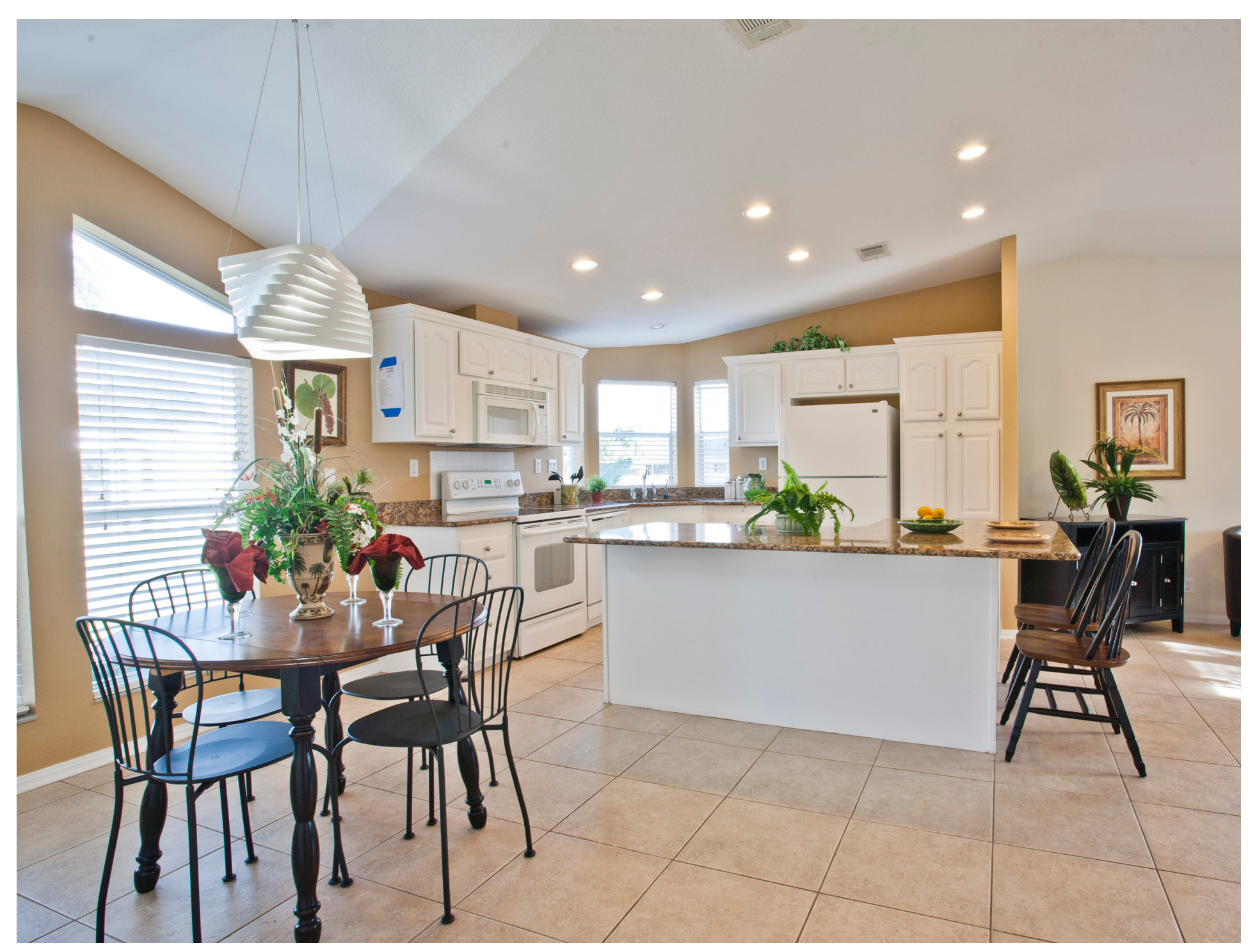
Upgrades shown: Ceramic tile floor, granite counters and upgraded lighting.