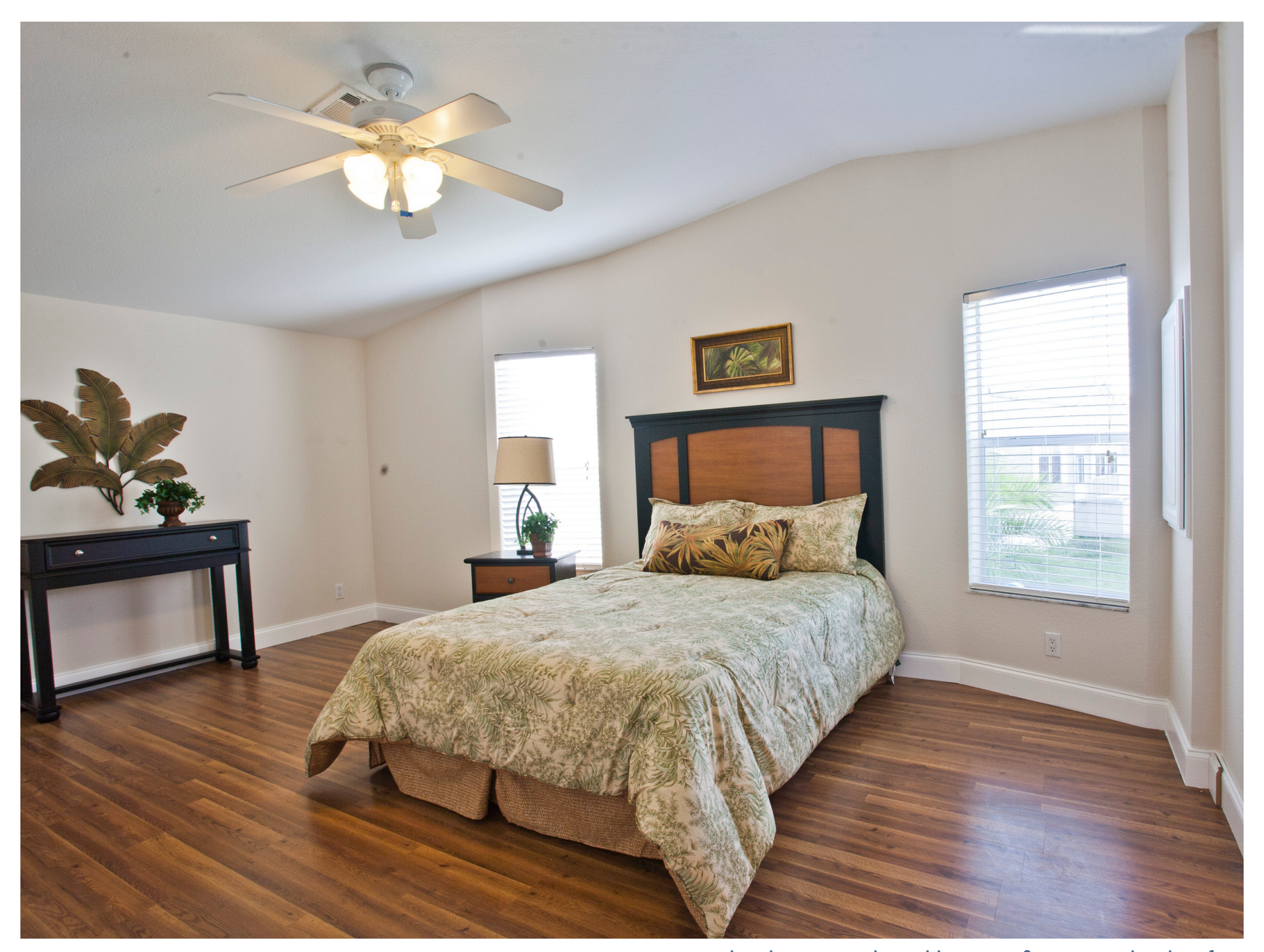
Upgrades shown: Hardwood laminate flooring and ceiling fan.