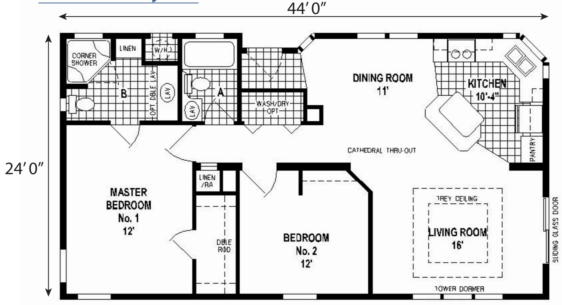
2 Bedrooms, 2 Baths, 1056 SF Shown with miscellaneous options