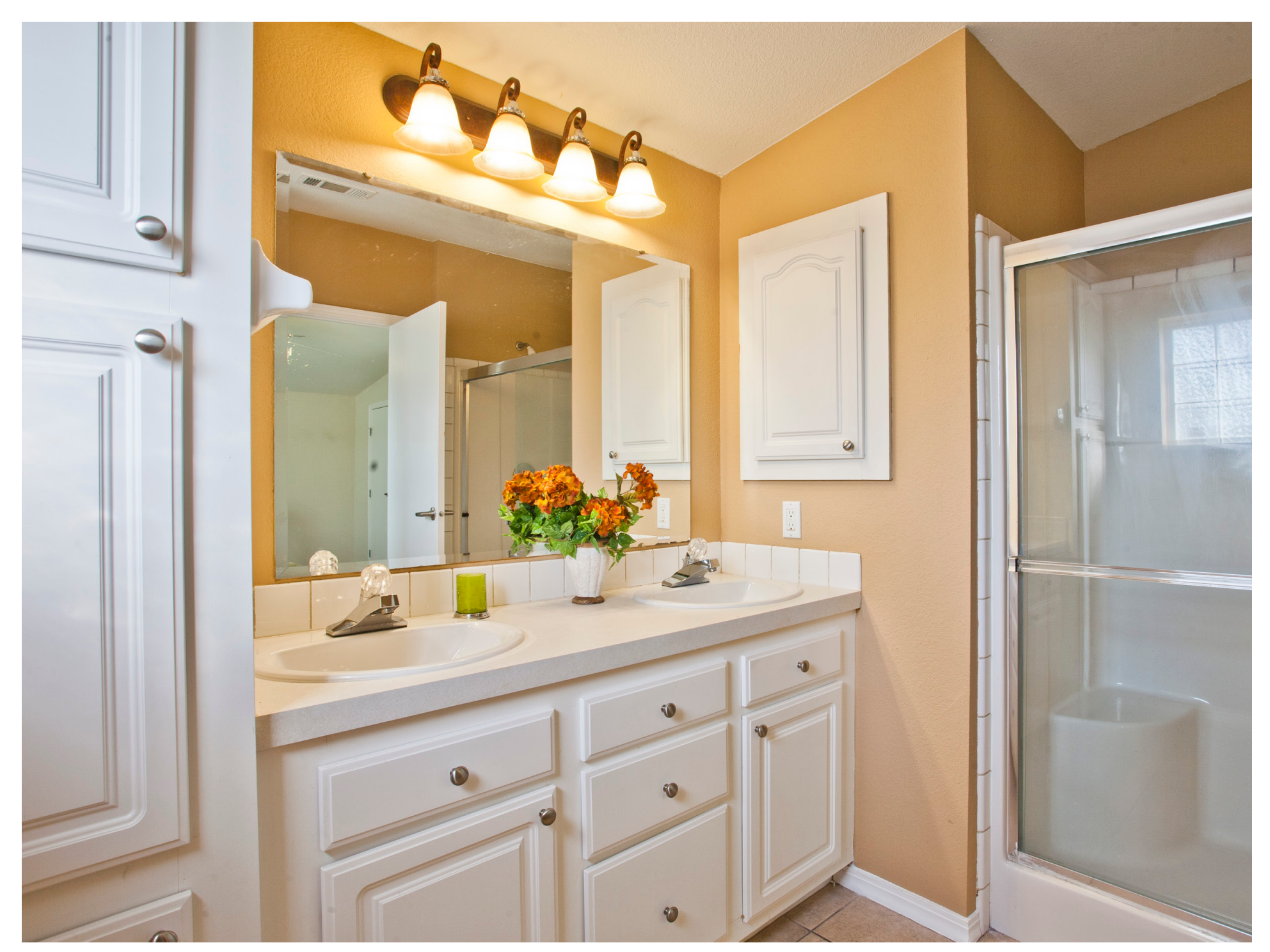
Upgrades shown: Custom light fixture.